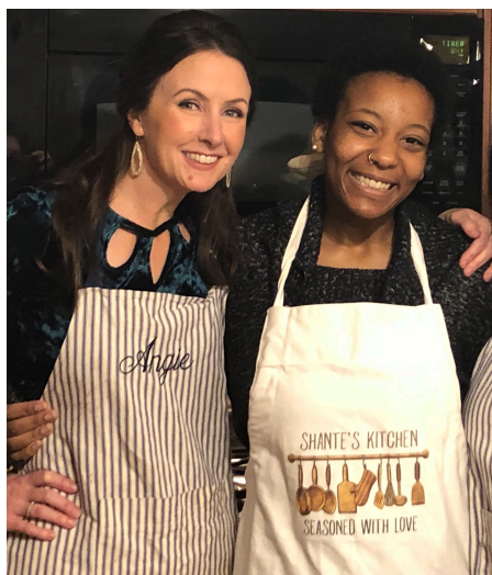
Friend who graduated Open Table 2 years ago and Table member in Virginia

It is important to note that a majority of young adults ages 21-25 have struggles with the goals of continuing education, gaining employment, and learning how to successfully navigate life. Even with a supportive family of origin, most adults can recount their own disasters during these formative years. The Pew Research Center (2019) on social and demographic trends cites that although most Americans believe young adults should be financially independent by age 22, the reality is that the majority of young adults are still financially dependent on their parents at age 29.