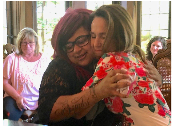
Friend and Table member in Ohio

In many of these important local efforts, significant programmatic progress has been made in the first three outcome areas. As they become adults, transition-age young adults may enter quality transition services which have been provided by non-profits or done in tandem with child welfare or juvenile justice agencies. Ideally, these transition services begin a number of months or even years prior to the transition-age youth becoming adults, avoiding the aging out "cliff" which can await many transition-age young adults.