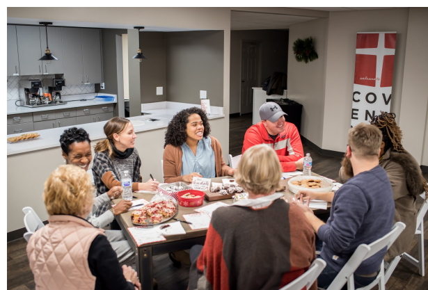
An Open Table serving a young adult in Ohio

Table members come from many different places, including when a business sponsors Tables, from faith communities hosting Tables, and from community organizations or non-profits. Open Table research on Table outcomes has found that Table membership changes not only the life of the Friend, but of the Table members.