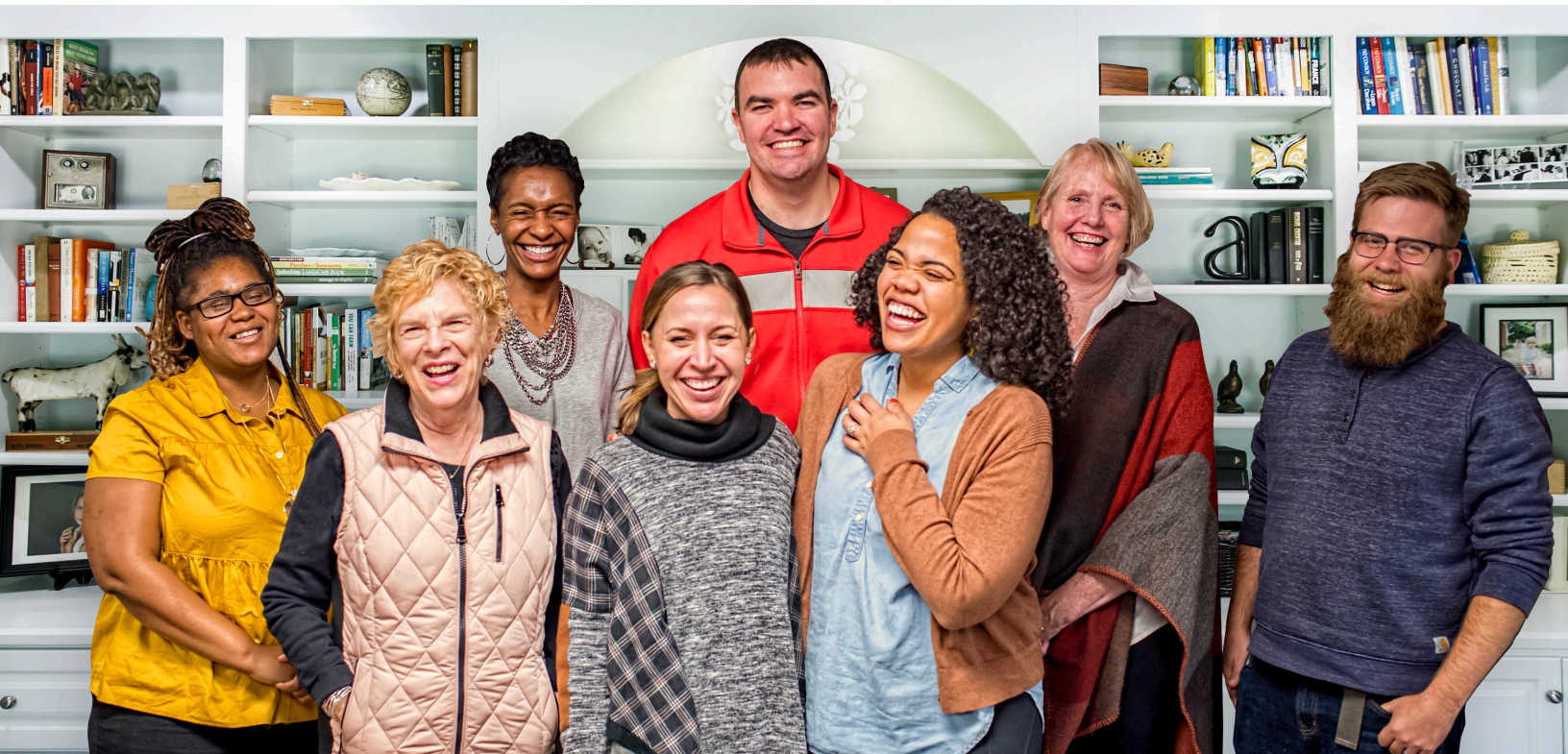
An Open Table in Ohio